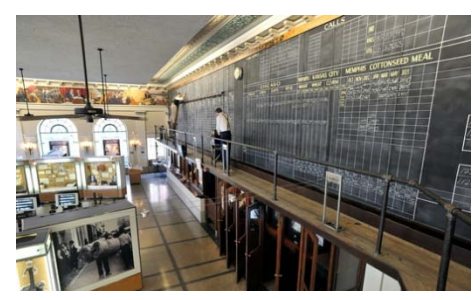
Andrea Zucker © Memphis Convention & Visitors Bureau 2011

Cotton Museum. Memphis is the largest spotcotton market in the world and, for generations, the historic Cotton Row district that surrounds the museum was the center of the worldwide cotton trade. At the Cotton Museum, you're treading on the legendary floor of the Memphis Cotton Exchange—where cotton traders once stood at the