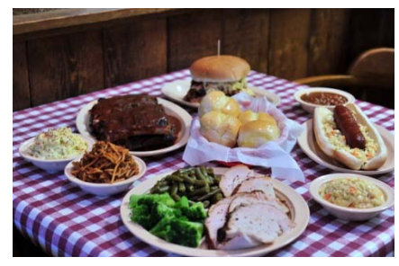
Andrea Zucker © Memphis Convention & Visitors Bureau 2011