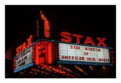
Dan Ball © Memphis Convention & Visitors