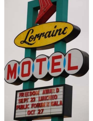
Kerry Crawford © Memphis Convention & Visitors Bureau 2011