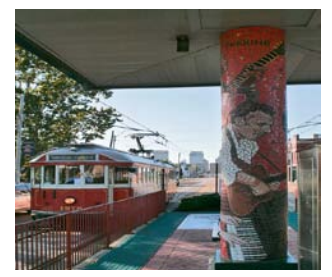
Baxter Buck